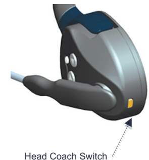
Head Coach Switch

Low profile switch is located on the bottom of the Head-Coach headset earcup. Audible tone confirms switching from offense to defense.