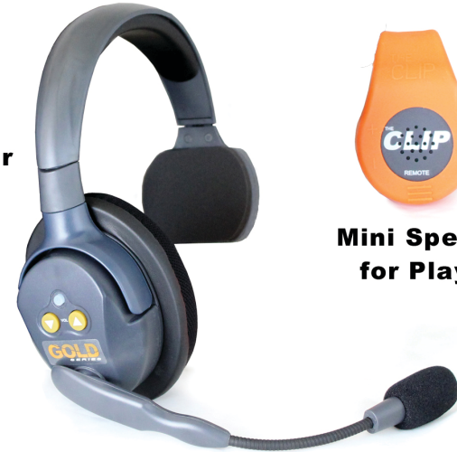
Headset for Coach

LITHIUM BATTERIES Provide continuous 4 hr operation.