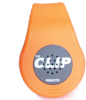
Mini Speaker for Player